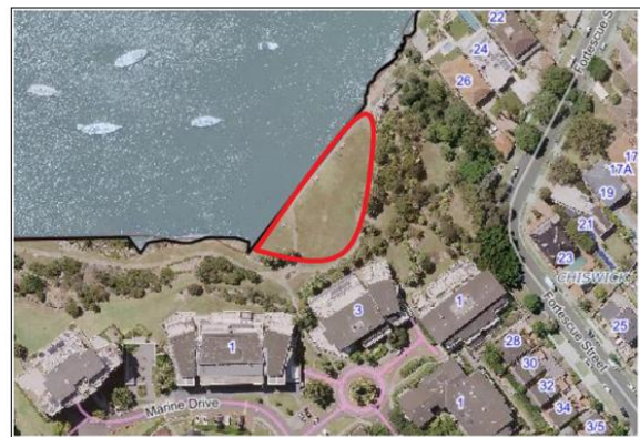
Proposed off-leash area

Canada Bay Civic Centre Drummoyne 1a Marlborough Street Drummoyne NSW 2047 Locked Bag 1470 Drummoyne NSW 1470 ABN 79 130 029 350