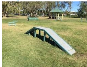
Table Dog Ramp

Examples of some obstacle and agility equipment.